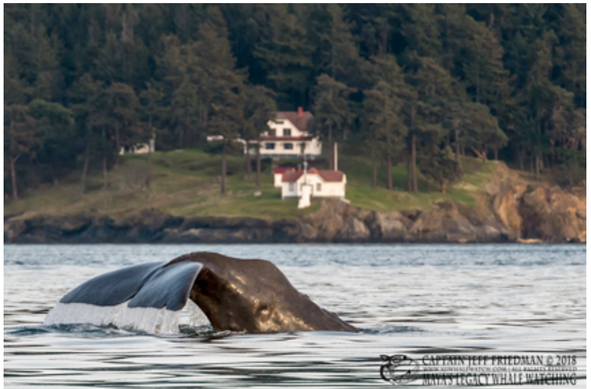
Rare sighting of a Sperm Whale at Turn Point